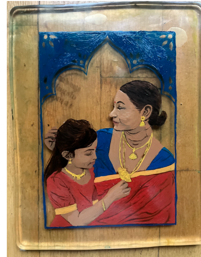
Fig. 5 First mono print based on my photography series on the jelly plate.