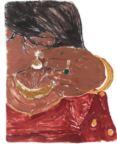
Fig.1 Experimental mono print

After discussing with my peers, they wanted to see more imagery of the past to incorporate the narrative of the past being brought to the present. So looking back into my research I found some imagery of British colonial postcards with women in South Asian adorned in ornaments. Like how the miniature portraits narrated these stories, I had envisioned the portraits to narrate the history of the tradition, and how it was used as a commodity in case of an emergency.