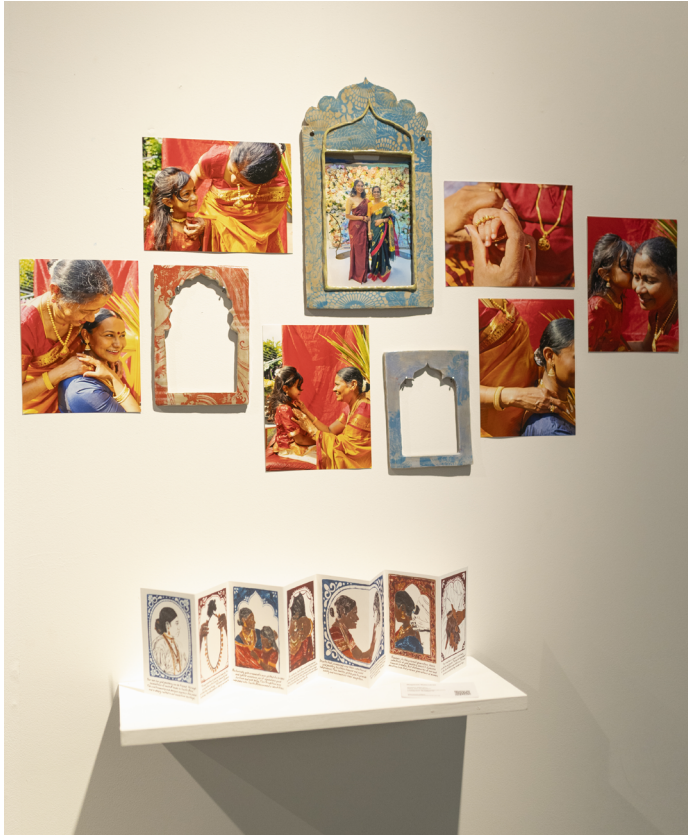
Fig 18. Photoseries with zine