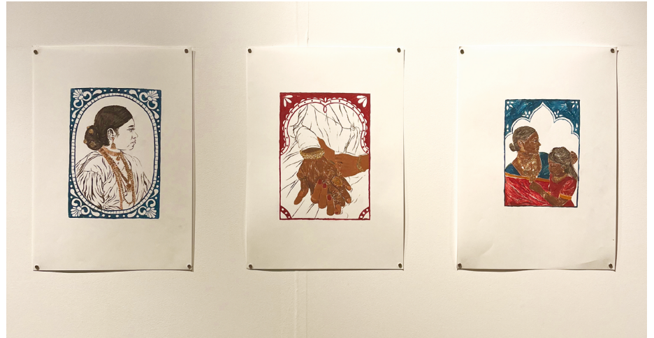
Fig 17 Prints displayed at the exhibition