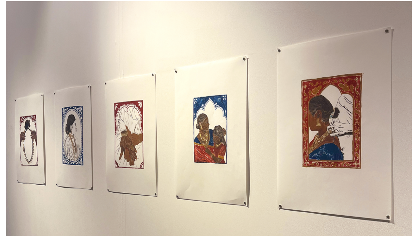
Fig 14. Monoprint series presented on the wall