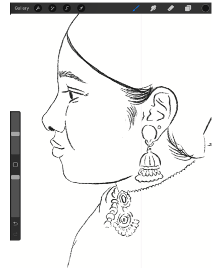
Fig. 4 Sketch referencing old photo from a british postcard.