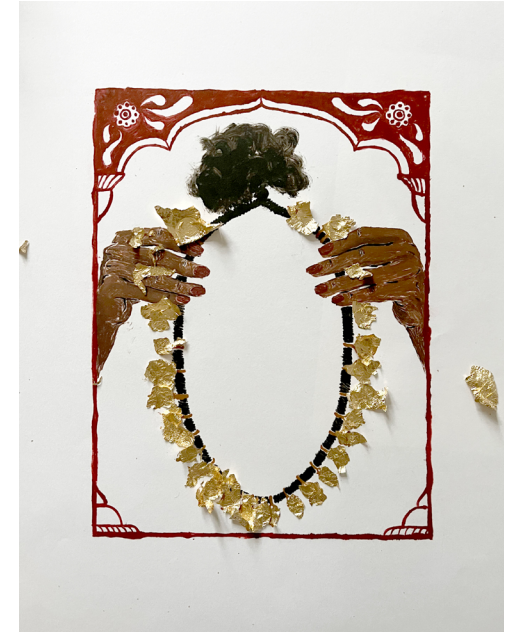
Fig. 11 Mono print based on a old photograph of a Tamil woman in the 1900