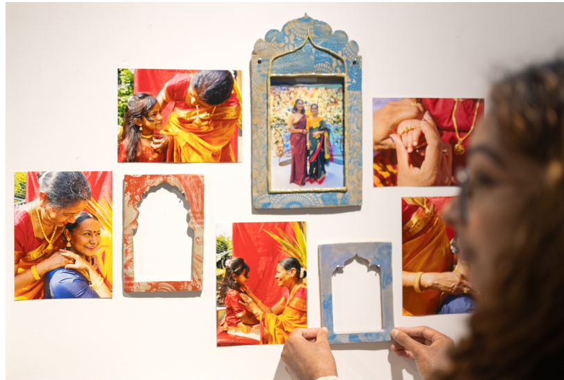
Fig 19. Ceramic frames with photography series