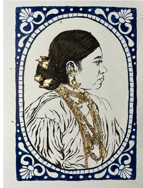
Fig. 10 Mono print based on a old photograph of a Tamil woman in the 1900

As time was hurdling towards the 'In Progress' show, I wanted to create my zine to present with the monoprints. I scanned the prints digitally and made a layout for it to be printed into an accordion zine. I thought using an accordion-styled zine (Fig.12) would showcase the prints well and I think it works well because of the rectangle-framed format. I added some text to contextualise the narrative and add a voice to the visual piece.