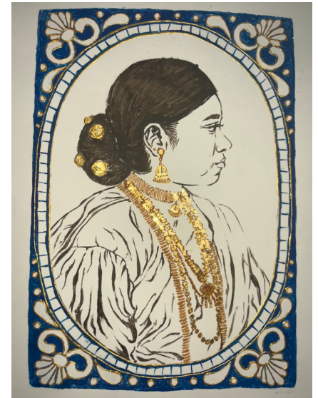
Fig 21. Ceramic frames with photography series.