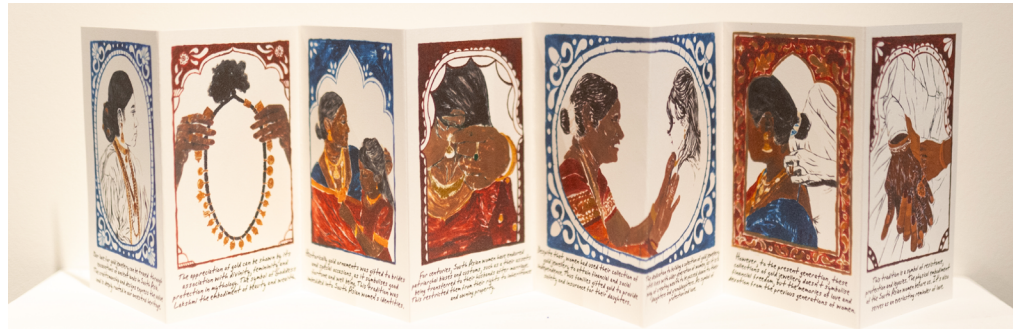
Fig. 12 Accordion Zine with the monoprints narrating the tradtion.