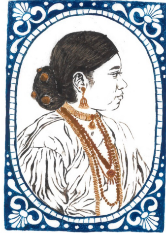
Fig 15 Digital scans of the mono prints