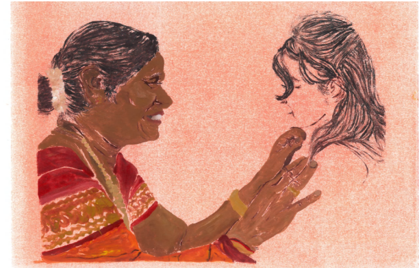
Fig.2. Experimental mono print