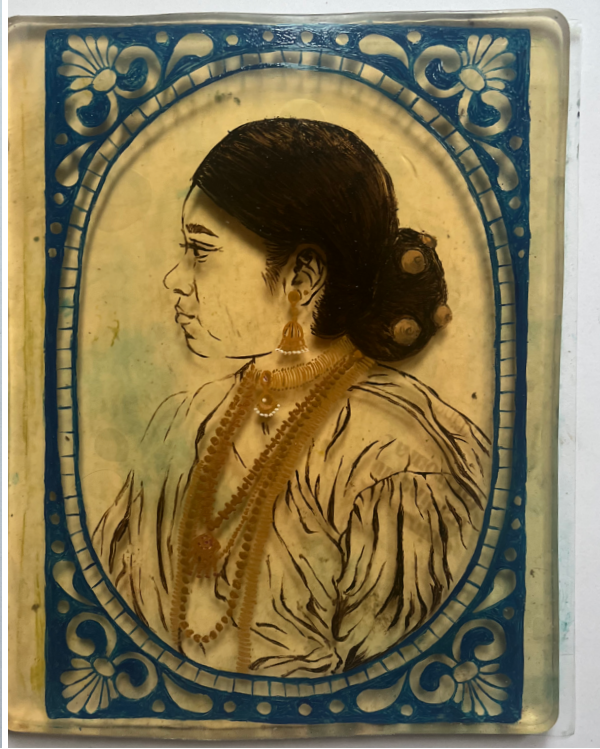
Fig. 8 Mono print based on a old photograph of a Tamil woman in the 1900