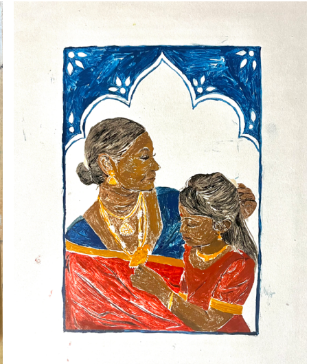
Fig. 6 Result of my first mono print on paper.