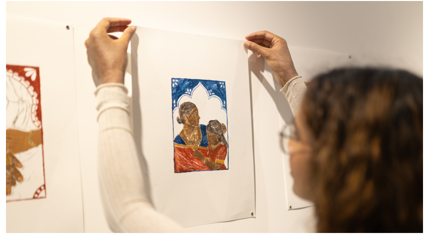
Fig 13. Monoprint with gold accent being arranged on the wall.

For my outcome for the 'In Progress' show, I created 5 mono prints (Fig 14.) and an accordion zine to present a visual narrative of the women in South Asia's tradition of passing gold and the shift in value as it is passed down from generations to the new generations. Through my research, I learned the in-depth history of how this tradition started and the twists of why this tradition continued through the ages. As a way to show how much parents love their daughters and give them jewellery as comfort, to being used in a state of emergency because of the lack of possessing property to their name. However, in more modern times, women have more autonomy and rights - especially in 1st world countries but this tradition continues. I have illustrated the new concept of how new generations of South Asian women keep this tradition to immortalise their ancestors and hold the memories attached to their mothers for comfort when they eventually pass. This is illustrated by the order of the prints in the zine that narrates the story and is contextualised to inform the reader.