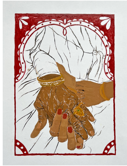
Fig 16 Digital scans of the extra print