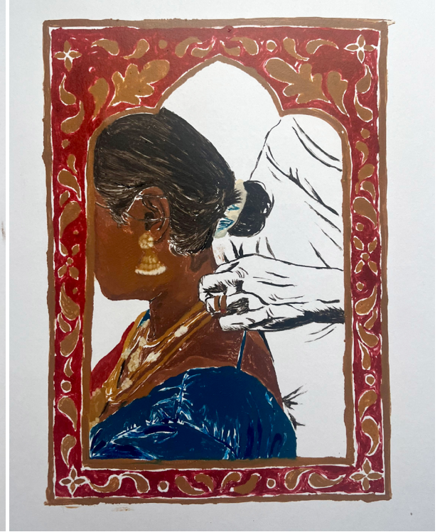
Fig. 9 Mono print of a mother and daughter holding hands on a jelly plate.