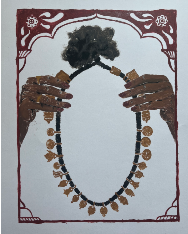
Fig. 7 Mono print based a Tamil wedding necklace in the 1900 from the V&A.