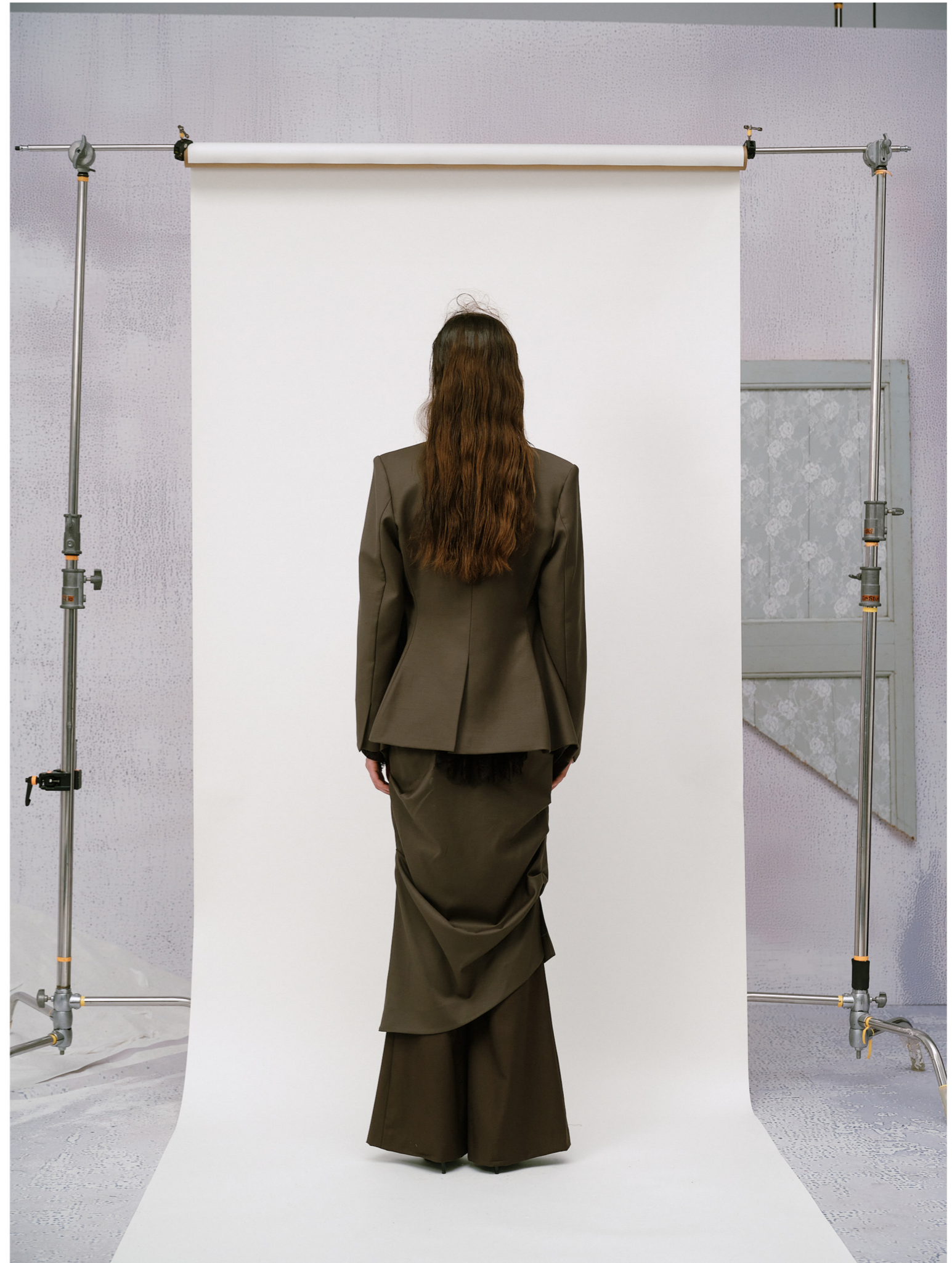
LOOK 2 ASYMMETRIC PLEATED SKIRT SUIT ENSEMBLE