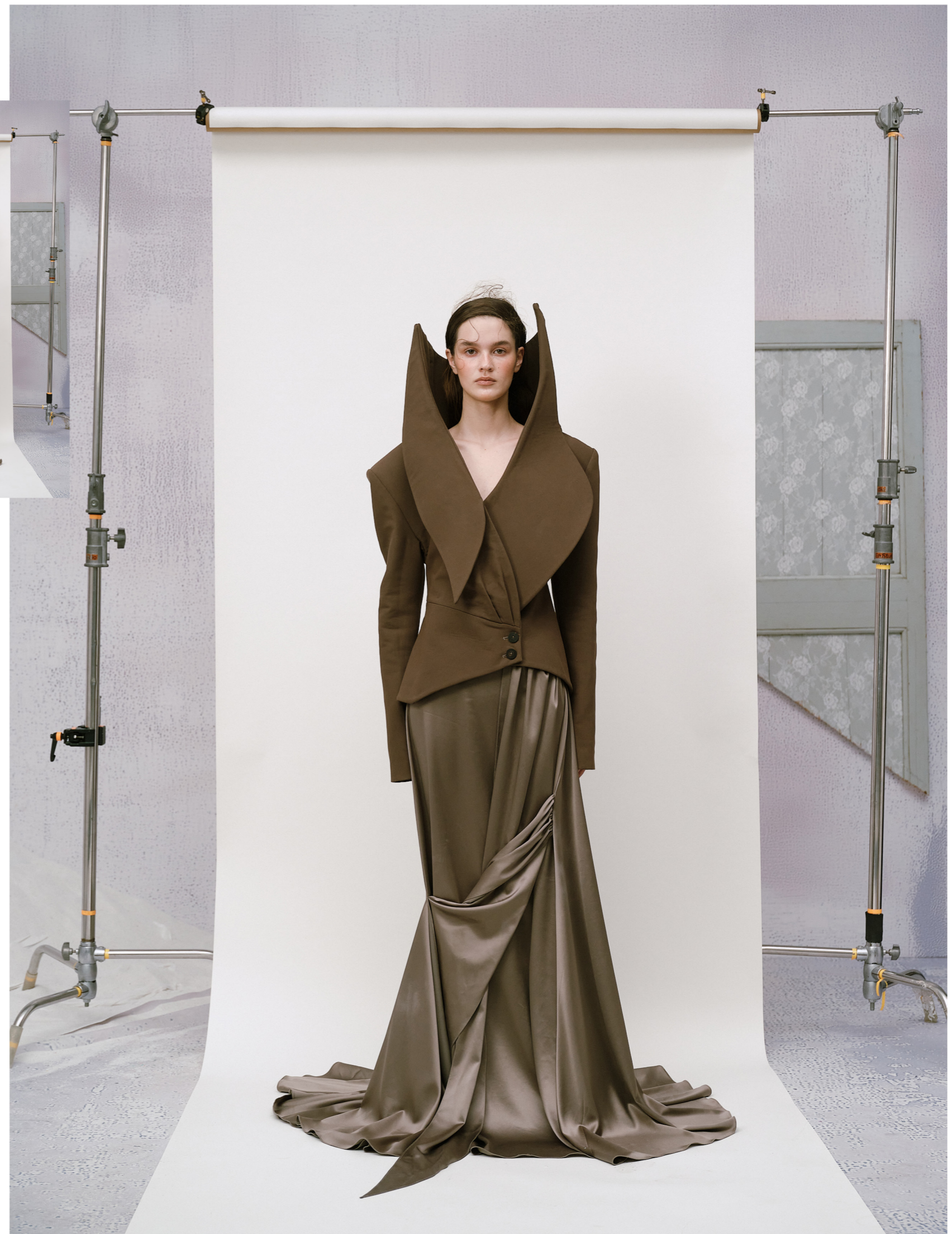
LOOK 1 STAND-COLLAR ASYMMETRIC SUIT WITH PLEATED MERMAID SKIRT