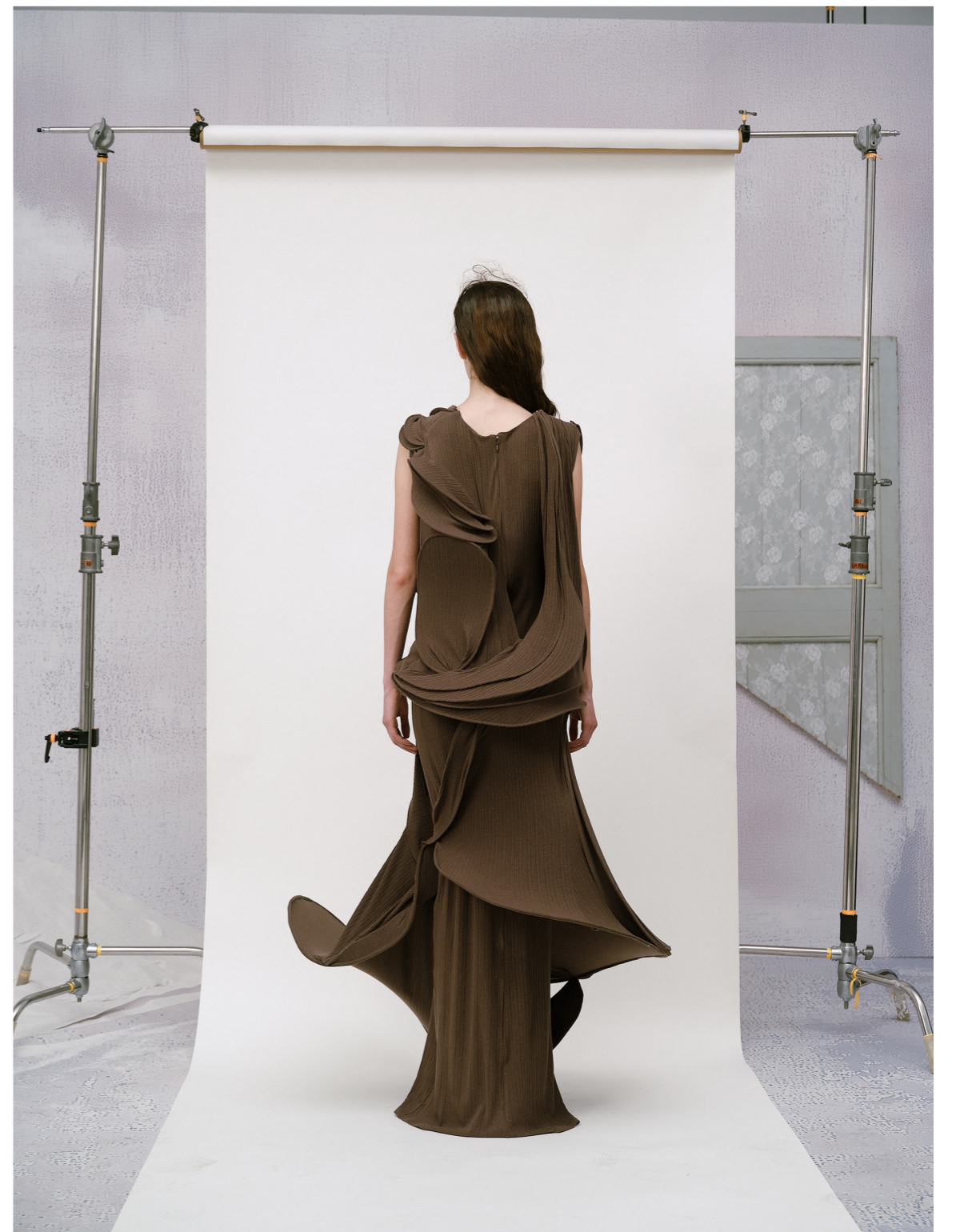
LOOK 3 DECONSTRUCTED ASYMMETRIC SPIRAL-PLEATED DRESS