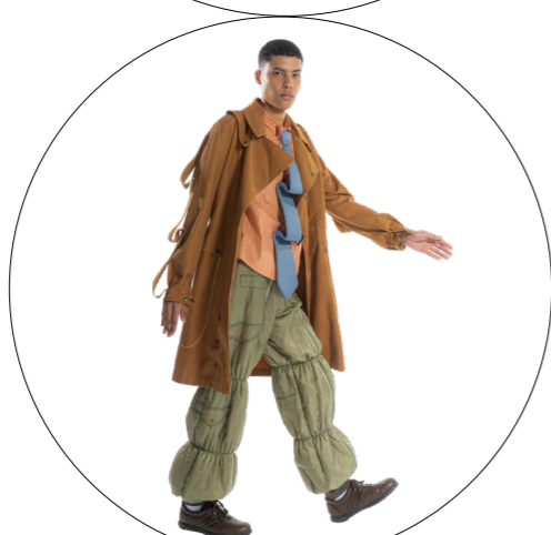
Look 2-British army dispatch rider coat & B-11A Trompe L'oeil embroidered flight pants