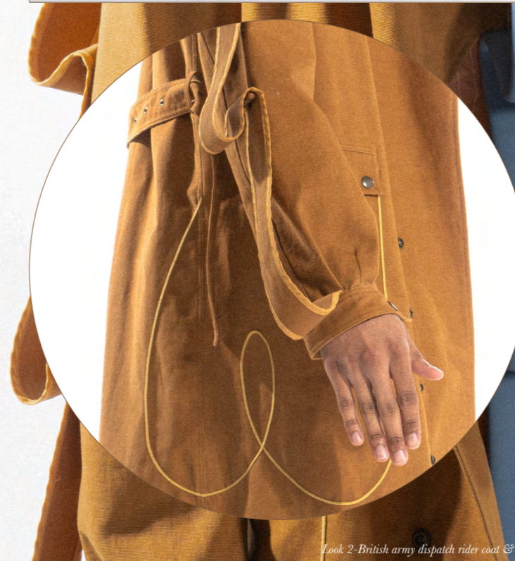
Look 2-British army dispatch rider coat & B-11A Trompe L'oeil embroidered flight pants