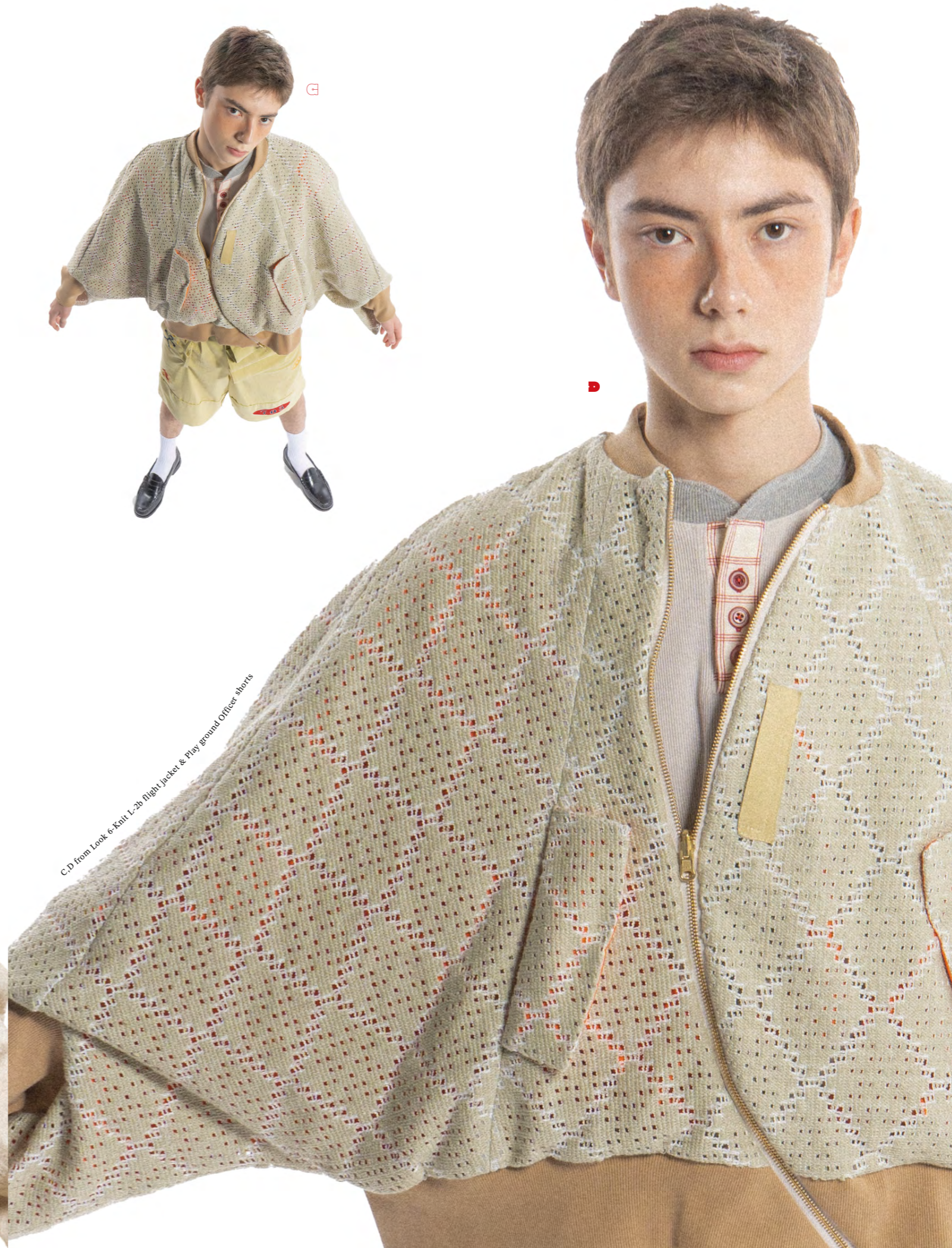
C,D from Look 6-Knit L-2b flight jacket & Play ground Officer shorts