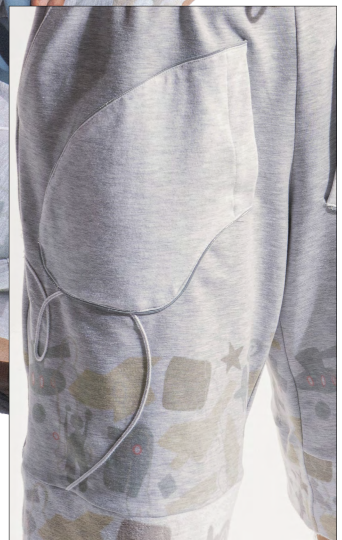
Look 1-Circle cape shirts with Slide tie & Playground camouflage army training shorts