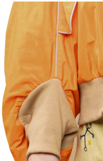
Look 6-Knit L-2b flight jacket & Playground offwer shorts