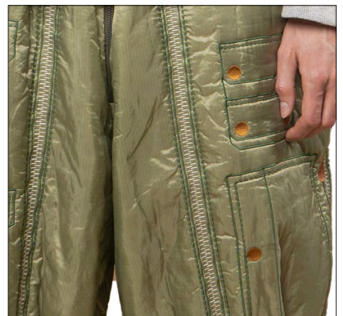
Look 8-Draped Hoodie long sleeve & B-11A Trompe L'oeil embroidered flight pants