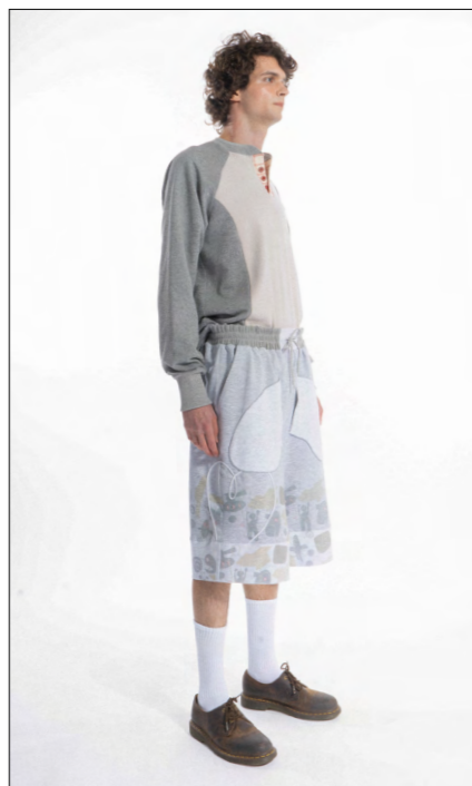
Look 5-Army henryneck sweat shirts & Playground camouflage army training shorts