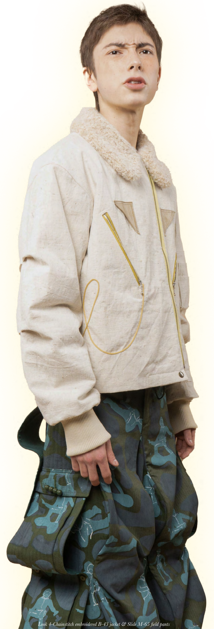
Look 4-Chainstitch embroidered B-43 jacket & Slide M-65 field pants