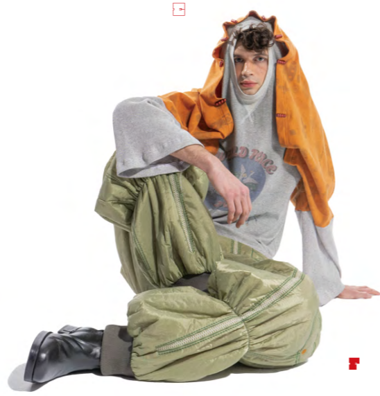
E.F from Look 4- Draped hooded long sleeve & B.11A pants