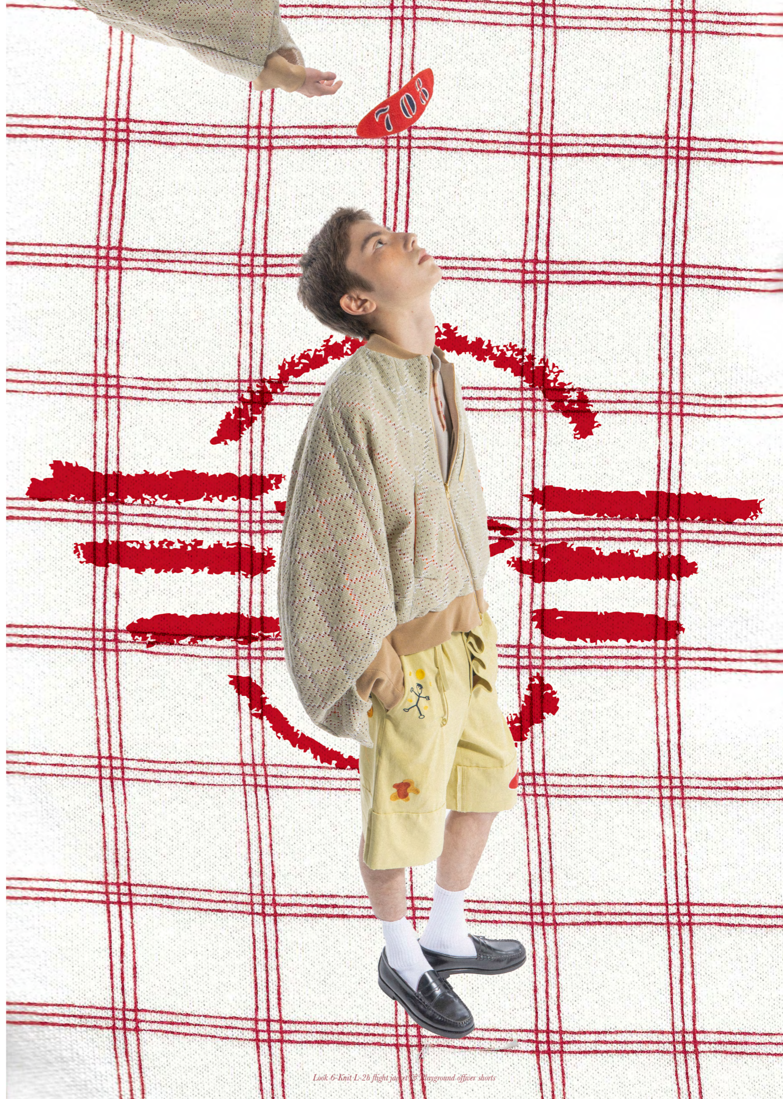
Look 6-Knit L-2h flight jacket & Playground officer shorts