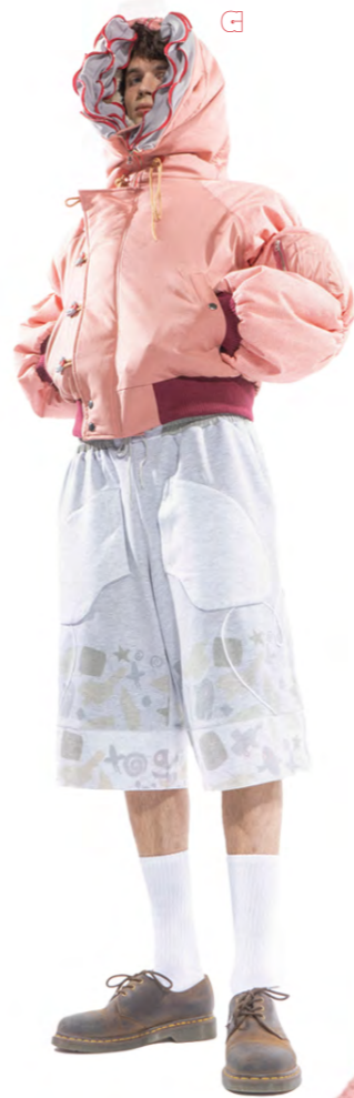
G.H from Look 5- N2B jacket & Trainini ng shorts