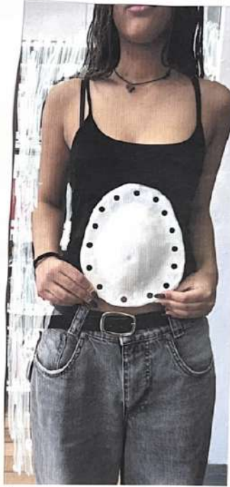
↑ on body ↓