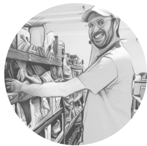
SHOP OWNER (Truck shop)