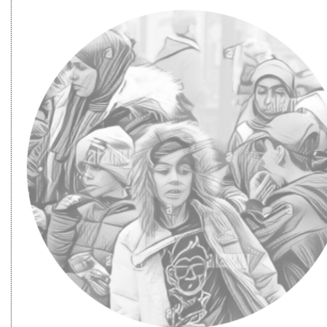
GROUP OF FAMILIES (Women & children)