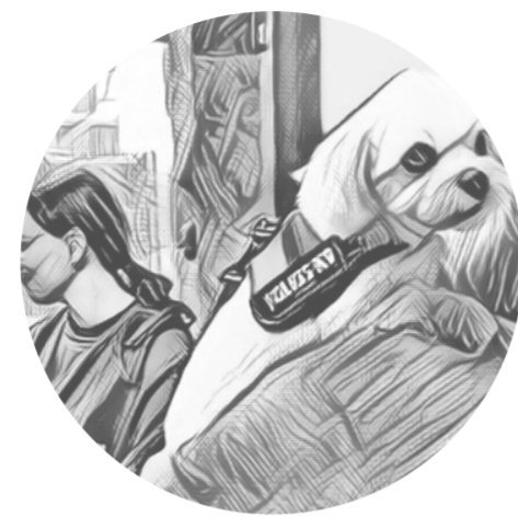
DOG & CAFE BARISTA (Barkney wick cafe)