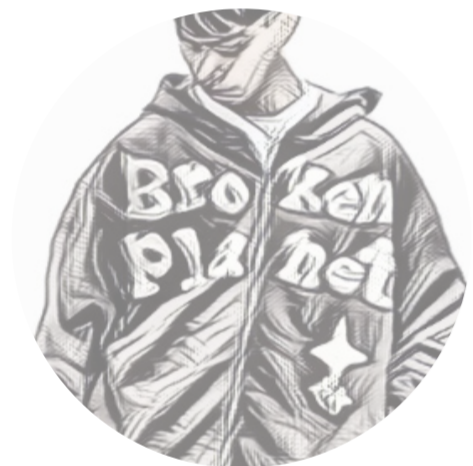
BRAND MANAGER (Broken planet)