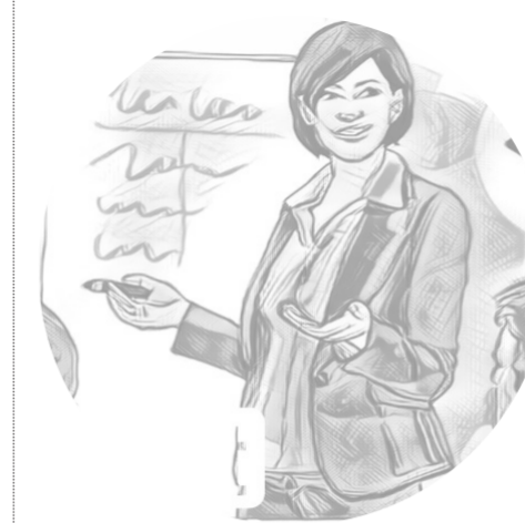
UNIVERSITY LECTURER (Teaching philosophy)